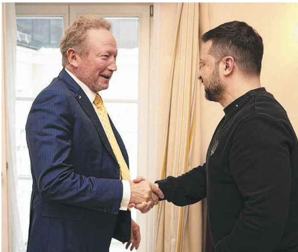
Ukrainian ambassador Vasyl Myroshnychenko with Andrew Forrest at the National Press Club on Monday; below, Mr Forrest with Volodymyr Zelensky